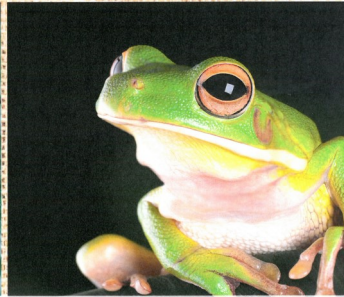
11th - Reptiles & Amphibians