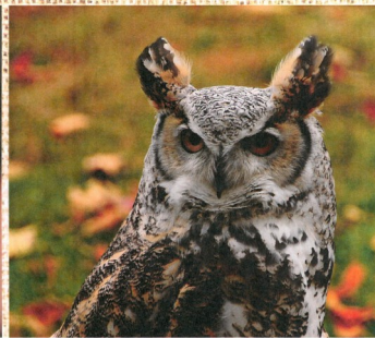
25th- U of M Raptor Center