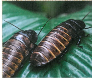
4th - Amazing Invertebrates