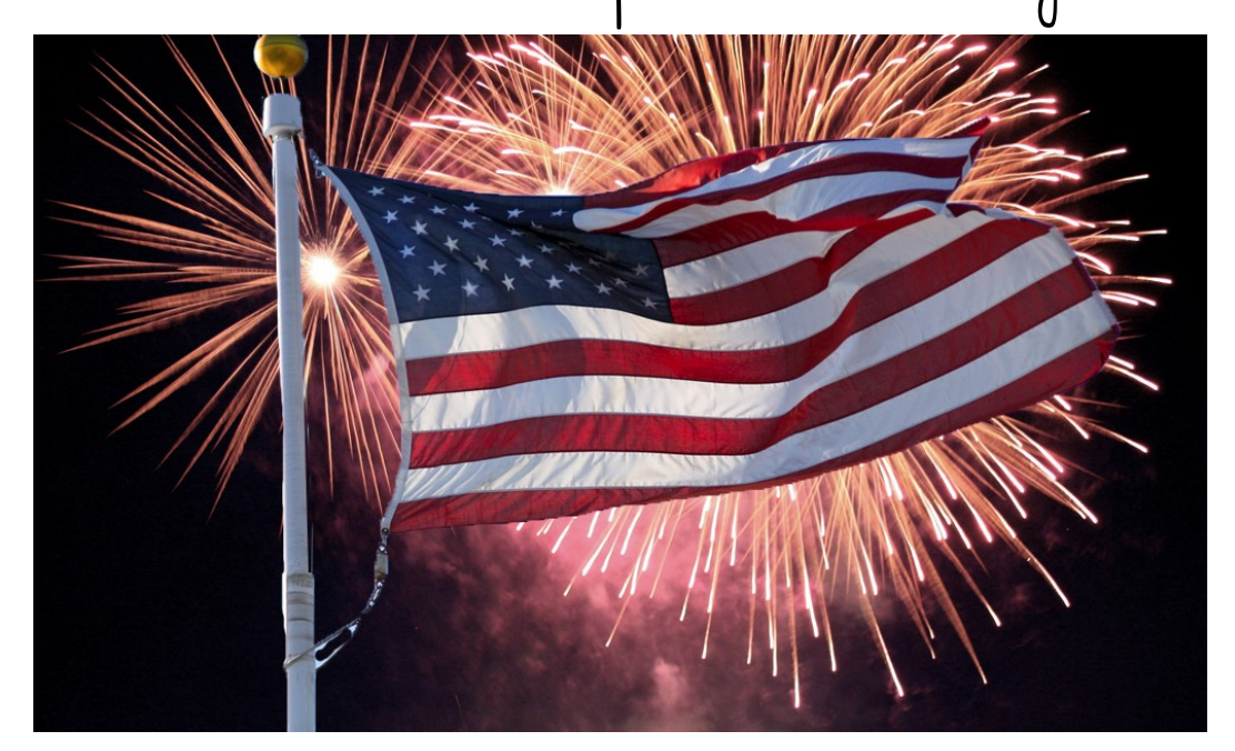
The church office will be closed on Thursday, July 4. Celebrate the holiday safely!