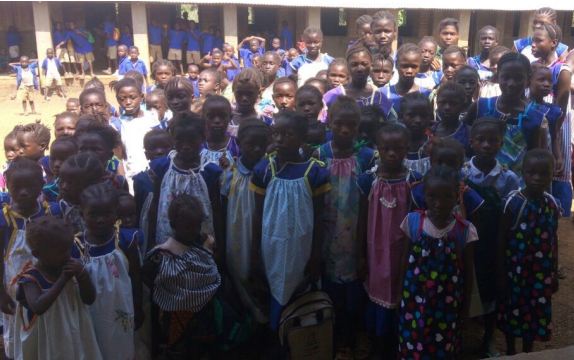
2016 mission day included pillowcase dresses for Sierra Leone girls.